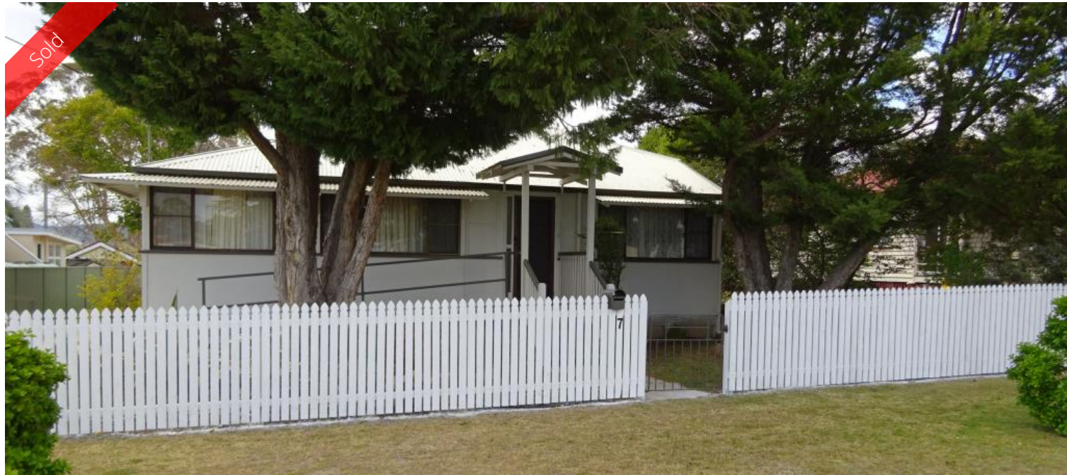
7 Lane St, Stanthorpe